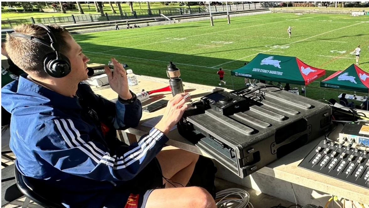
The Spectera Base Station makes multichannel portable

"Even though this was a new type of setup, there were no nasty surprises, and I was able to do most of the rigging myself", shares Wong. "Once the system was up, our field crew, who hadn't seen Spectera before, were able to get across it quickly and run it live. It sounded great and the talent was very happy."