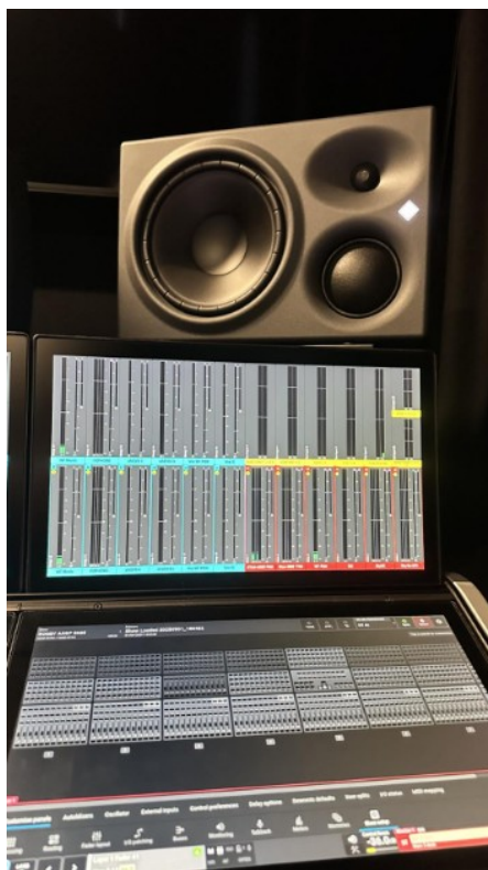
Neumann monitors in NEP's hub