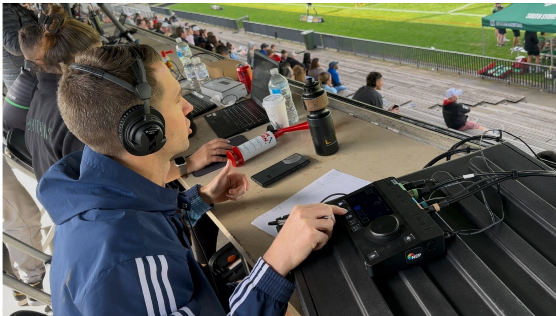
NEP and Anubis in action